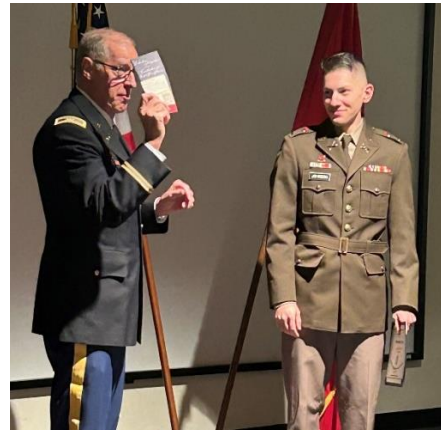
Remarks and presentation of U.S. Constitution

MENTORSHIP PROGRAM. Our Mentorship Program is going strong. Mentors routinely meet once a month with their mentees at local restaurants to discuss leadership, military culture, profession of arms, and a variety of other topics. Feedback from the Air Force and Army ROTC departments is overwhelmingly positive.